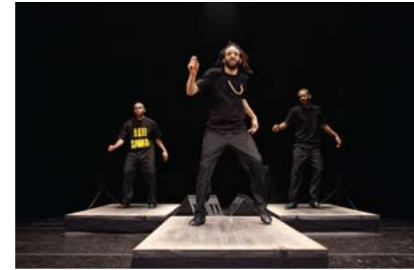
Savion Glover | OCT 10, 2009

Musica Angelica returns for the Second Season to The Broad Stage. Regarded as Southern California’s premier Baroque orchestra, Musica Angelica is back for three performances this season. They sold out last year; don’t miss them this season.