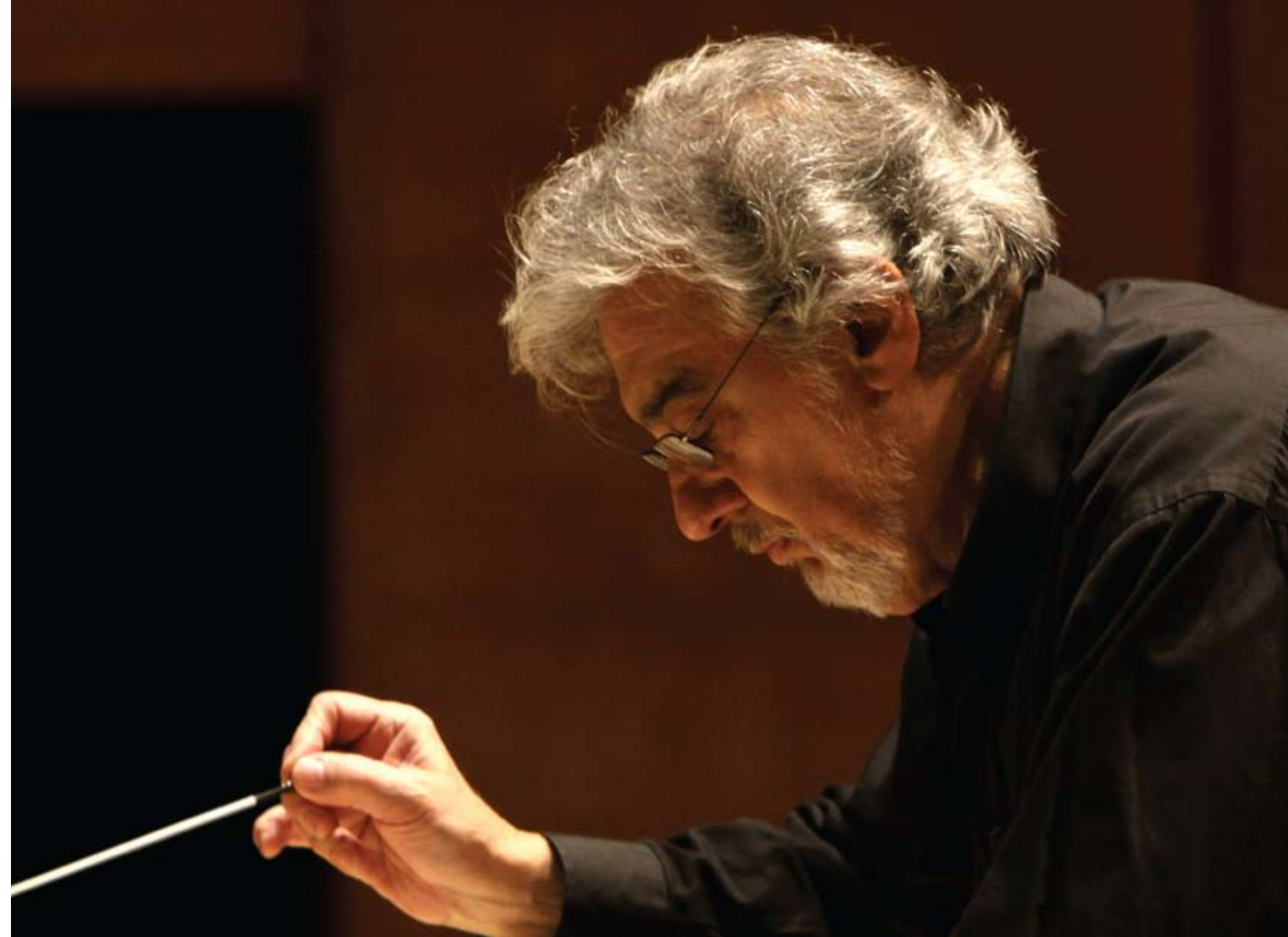
Plácido Domingo | MAY 21, 2010