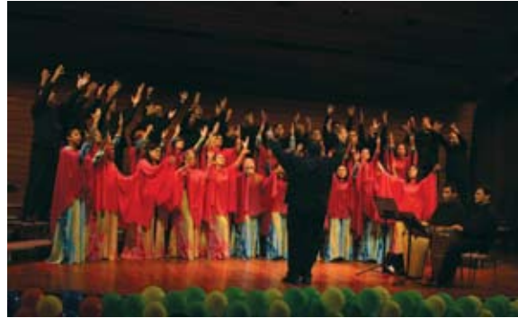
Schola Cantorum de Venezuela | APR 26, 2010