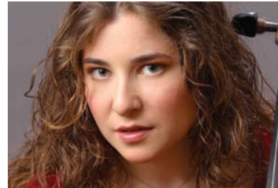
Alisa Weilerstein | JAN 24, 2010

Newsday said “...a crackling force field permeated Alice Tully Hall so that by the end of the evening, you could almost feel your skin tingling.” The world renowned ensemble performs Debussy’s Violin Sonata and Première Rhapsodie for Clarinet and Piano , Ravel’s Sonata for Violin and Cello and Olivier Messiaen’s Quartet for the End of Time . Intricate, challenging, uncompromising works—nothing less than you expect from The Broad Stage.