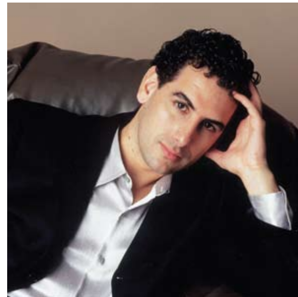
Juan Diego Flórez | NOV 3, 2009